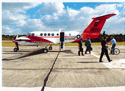
Pictured is the refurbished King Air that was put into the scrap yard by the Department of the Navy and was awarded to LCMCD. Our aircraft mechanics spent long hours to get it overhauled and working. It sat for years in the hot sun in Arizona.

The Aerial Fly-In was held January 9th through the 12th at LCMCD. Mosquito Districts from all over Florida flew in for classes.